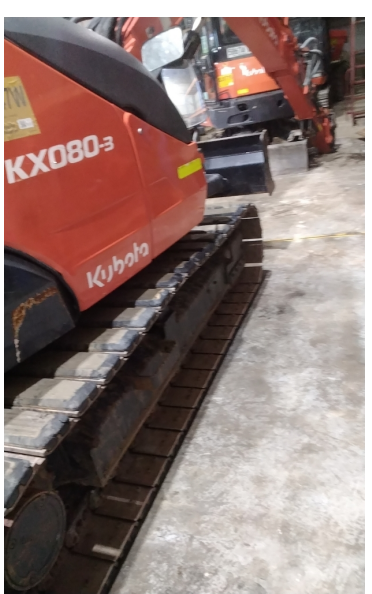
Tyre Condition 2