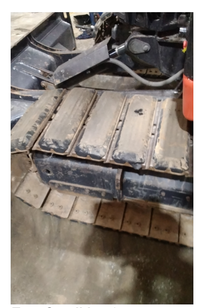
Tyre Condition 3